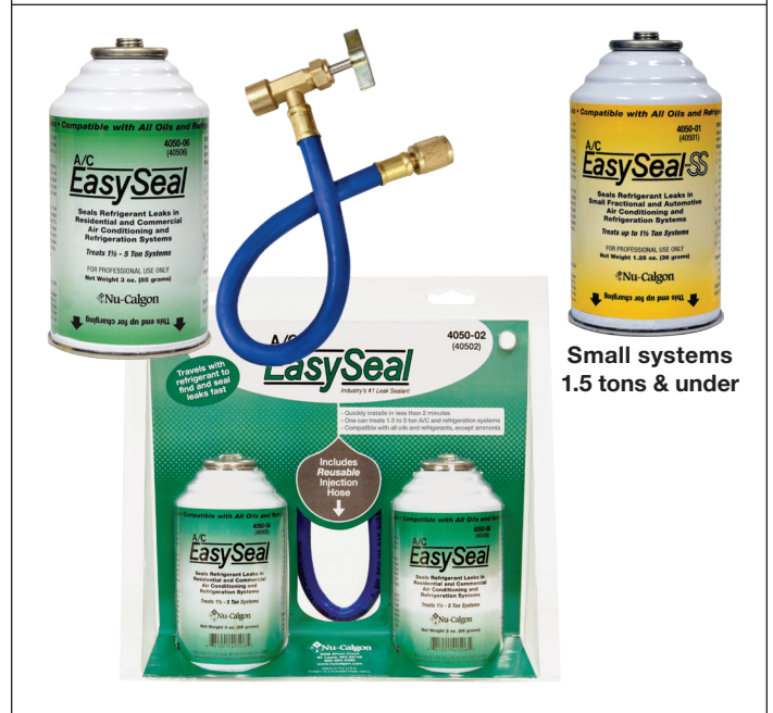
Small systems 1.5 tons & under

In most cases, one can will seal systems that have lost all refrigerant in as little as seven days and is designed for large systems up to 5 tons. For systems 1.5 tons to fractional, use A/C EasySeal-SS.