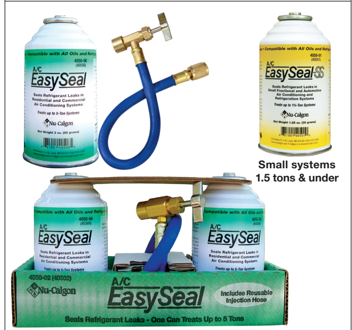
Small systems 1.5 tons & under

In most cases, one can will seal systems that have lost all refrigerant in as little as seven days and is designed for large systems up to 5 tons. For systems 1.5 tons to fractional, use A/C EasySeal-SS.